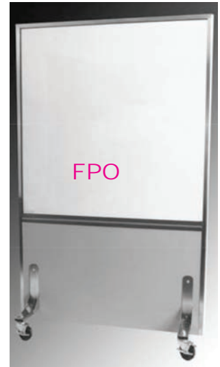
DM-420 Mobile Deluxe Barrier

Barriers can be constructed in any single section width up to 96" with lead acrylic window size up to 96"W x 48"H with lead equivalencies from 0.3mm to 2.0mm. Mobile barriers are made in 80" height to allow for passage thru standard 84" hospital doors. Any fixed or mobile barrier can be supplied with a shelf and or storage compartment.