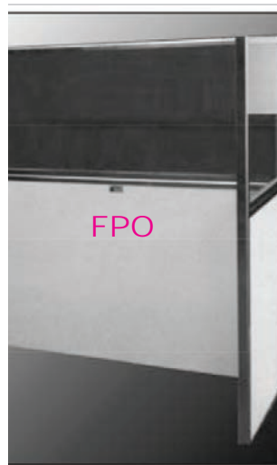
DB-420 Two Section

36" W x 84" H. Lead acrylic view window. Lower 36" W x 36" H leaded opaque panel.