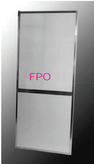
DB-420 Single Section